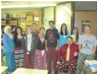
Even some of our teacher's participated in this event.